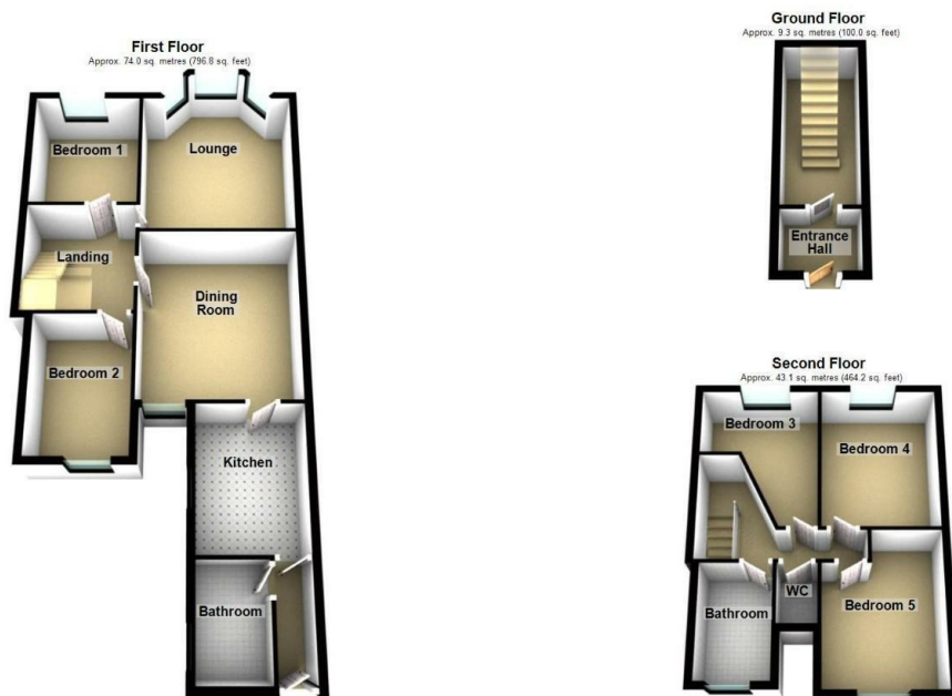
Total area: approx. 126.4 sq. metres (1361.0 sq. feet) Please be advised the floorplans are not drawn to scale and are to be used to give an idea of the layout of the property. Plan produced using PlanUp.